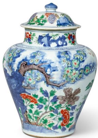
Wucai "Peony" Jar and Cover Qing Dynasty, Kangxi Period 22x22x28